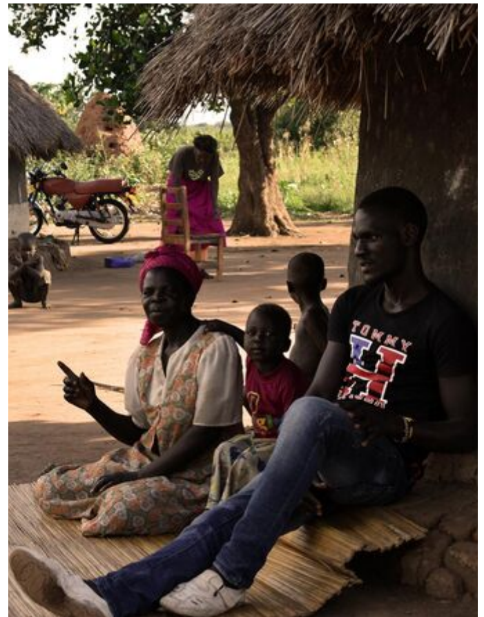
FP REACH IN AGAGO, AMURU, GULU & NWOYA DISTRICTS

During the period, GWED-G mobilized and referred 58,766 new family planning acceptors for services. 301 VHTs were trained on Community-Based Family Planning and supported to report FP activities at the community level. During community integrated outreaches, GWED-G and its partners were able to provide counselling services on FP for eligible clients totalling 6568 people, focused especially on those below the age of 20 years. Short-term methods like male and female condoms, Sayana press, Depo Provera and oral pills were provided. For long-term methods, communities were referred to nearby health units. Family planning behavioural change at the community level was enhanced through the use of targeted community dialogues in areas of high fertility to counter myths and misconceptions about FP methods. Local FM radio stations and cultural and religious leaders were leveraged to reinforce uptake of FP services.